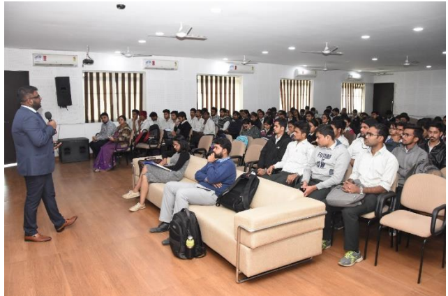
Visit to HCL Office