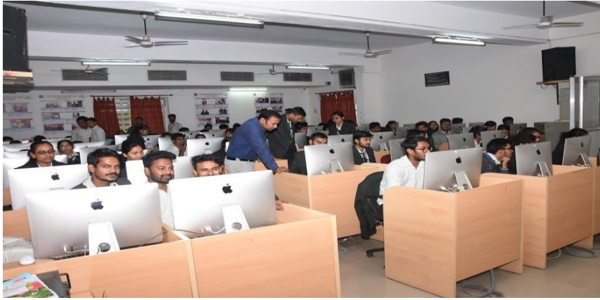
Resume Writing Session in GP-V